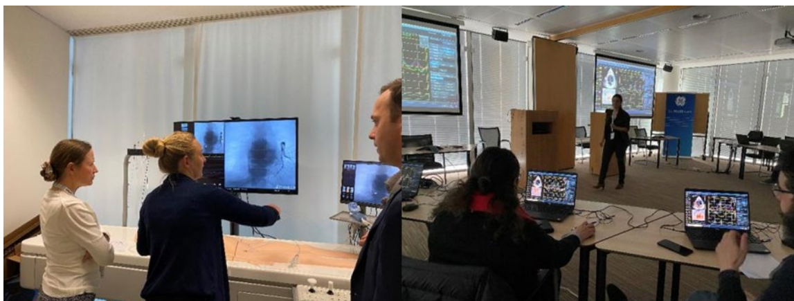
Figure 4: Supervised implantation of a CardioMems R device on the simulator (left) and advanced echo training with simulated patient cases at the Abbott Advanced Technology Center in Brussels.