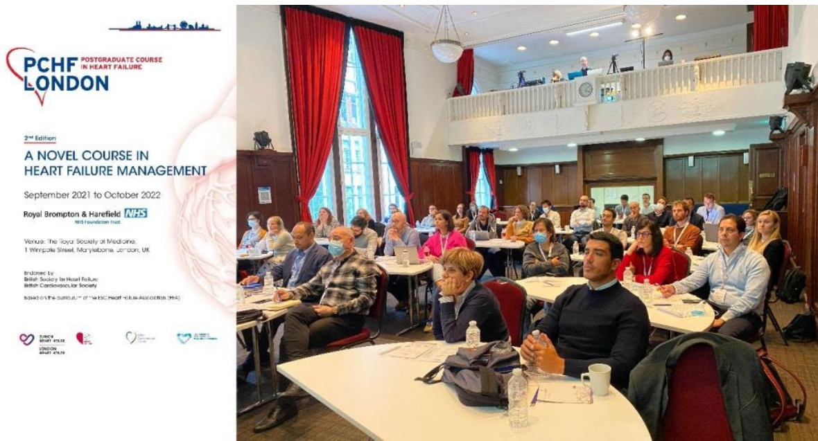
Figure 2: The 2 nd London Postgraduate Course on Heart Failure Management at the Hallam Conference Center in London with participants on site.