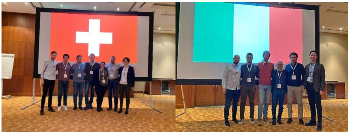
Figure 3: Course participants come from 23 countries from four continents: Here students from Switzerland and Italy.