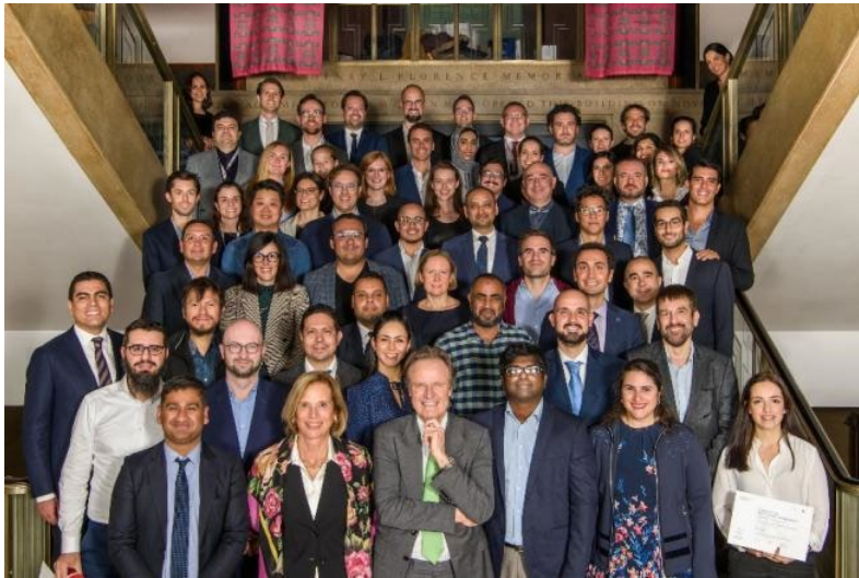
Figure 6: Proud graduates received the Certificate in Heart Failure Management during the ceremony at the Royal Institute of British Architects.

The graduation ceremony took place at the Royal Institute of British Architects (RIBA) together with faculty members and the alumni community of the PCHF London ( Figure 6 ).